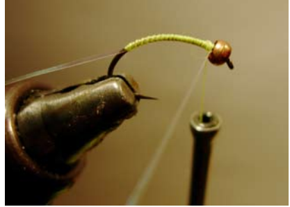
Steps 1 & 2

1. Smash the hook barb unless you are using a barbless version of the hook, and slip the bead around the bend. Cover the shank with thread.