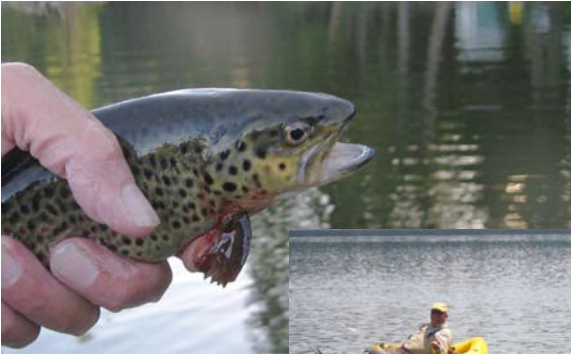
Left: What everyone wanted.