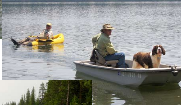
Right: Outgoing president towing the new one.