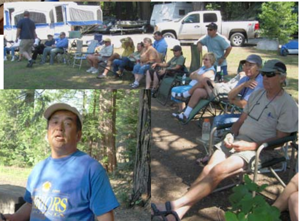
Right: Watching the casting games