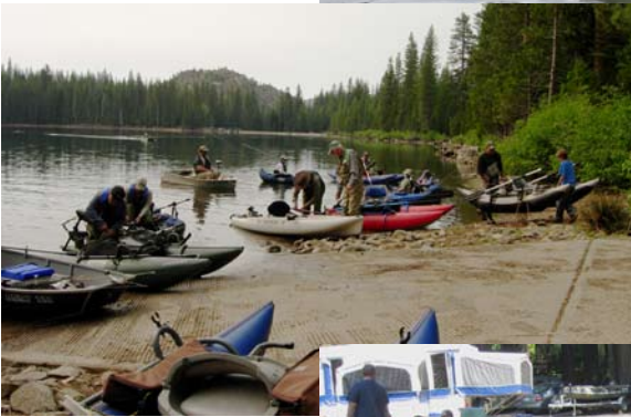
Left: Launching for the one-fly contest.