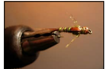
Steps 6 and 7, and completed fly