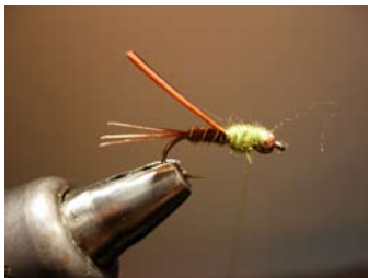
Steps 4 and 5