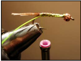
Steps 1 and 2